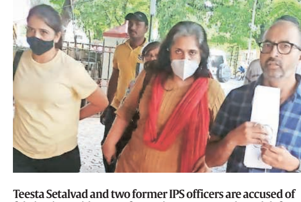
fabricating evidence to frame 'innocent people and defame Gujarat' in connection with the 2002 riots. File