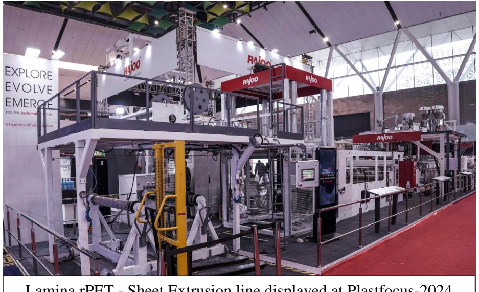
Lamina rPET - Sheet Extrusion line displayed at Plastfocus-2024

In line with its dedication to sustainability, Rajoo unveiled its rPET sheet extrusion line, that transforms PET bottle flakes into high-quality sheets, effectively closing the loop in plastic production processes. With outputs reaching up to 1400kg/hr, this initiative underscores Rajoo's commitment to leading the charge in promoting recycled plastics and sustainable practices.