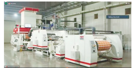
Rajoo-Kohli Lamex 360 coextrusion laminator at Balaji Multiflex in Rajkot Screenshot PSA